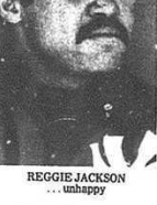
REGGIE JACKSON ... unhappy

with certain guys on this team. I never do damage to other players. The only damage I do is to myself. I can't understand what the problem is, I'm one of the big producers on this team."