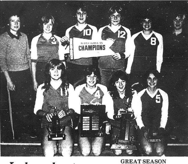
The Vernon Curling Club team, including players and coaches, holding a 'CHAMPIONS' banner.