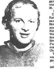
GERRY CHEEVERS ... blanks Leafs