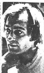
GUY LAFLEUR ... three-point

The Rangers and the Phillies also made a deal and LeFlore probably will move to left and Warren Cromartie to first base as a replacement for Tony Perez, lost via free agency to Boston Red Sox.