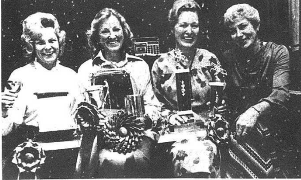
Vernon Canadian Dressage Owners and Riders Association (CADORA) recently held an awards banquet to recognize the club's top riders. From left,