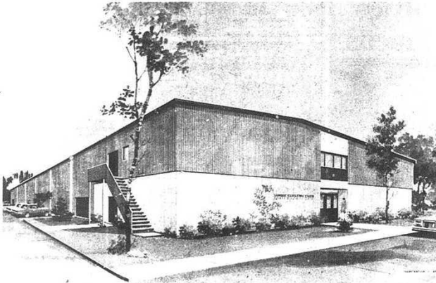
LUMBY'S PROPOSED RECREATION COMPLEX/CURLING CLUB

In addition, application for a Recreation Facilities Assistance Grant will be made and should be approved. That would reduce the cost by one-third. Funds from both provincial and federal lotteries may also be available. Two years ago, Greater Vernon narrowly approved a recreation referendum which is allowing this city's facilities to catch up with the needs of the community. The new facilities such as the Recreation Complex arena, and gym, lacrosse box at Greendale Park, softball fields at Kin Track, and picnic area at Kin Beach have provided an opportunity for thousands of people to participate in activities. The new facility in Lumby could perform a similar duty for that area and give the community a complex to be proud of. On Nov. 17, think of the future and vote yes.