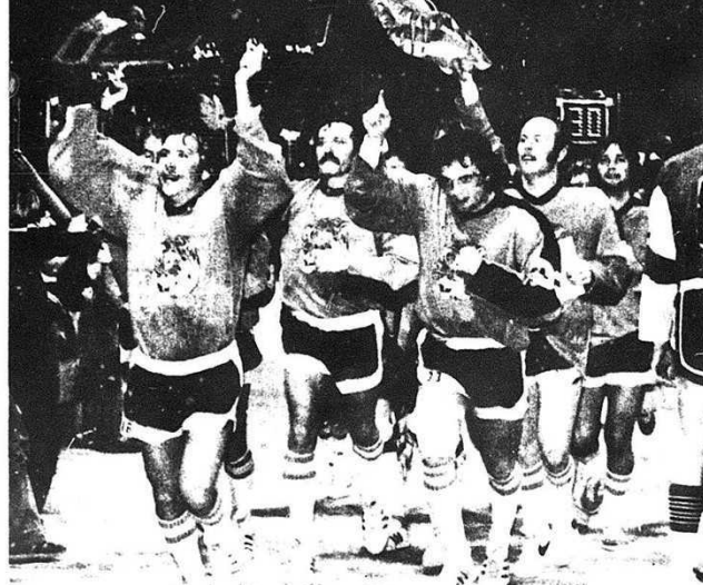
THE NUMBER ONE sporting event of the year was the Canadian Senior 'B' Lacrosse Championships... and the year's top team was the club that won that tournament, the Vernon Village Green Inn Tigers.