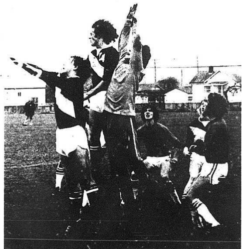
AT B.C. CHAMPIONSHIPS

Hillside topped the boys' event with Claremont, of Victoria, in second spot.