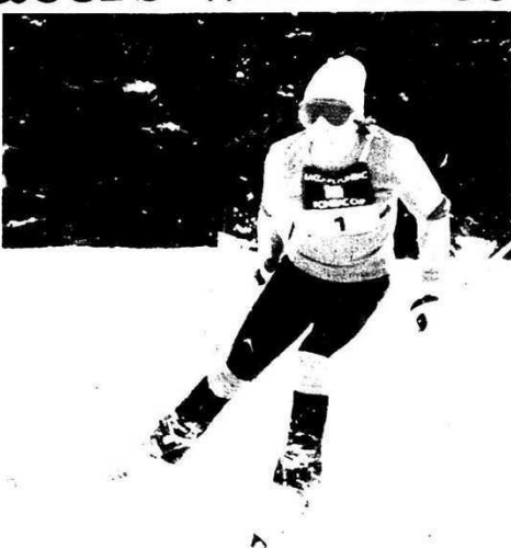
SPEEDING towards the finish line during Friday's Pontiac Cup slalom event