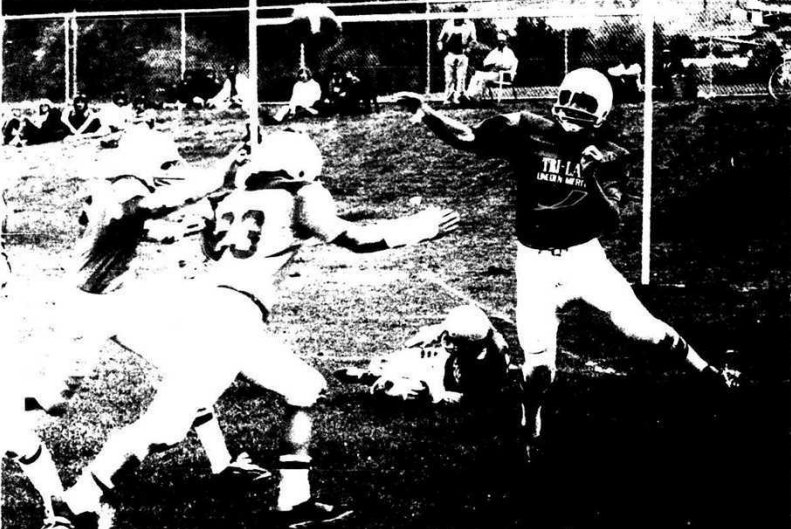
HARD HITTING , fast and exciting bantam football is now being played in