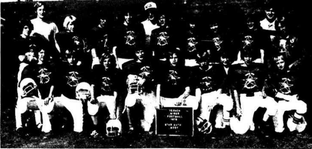
1976 Vernon Minor Football Association champions are above. Star Auto-Vernon Frame (tackle division) and Starviva