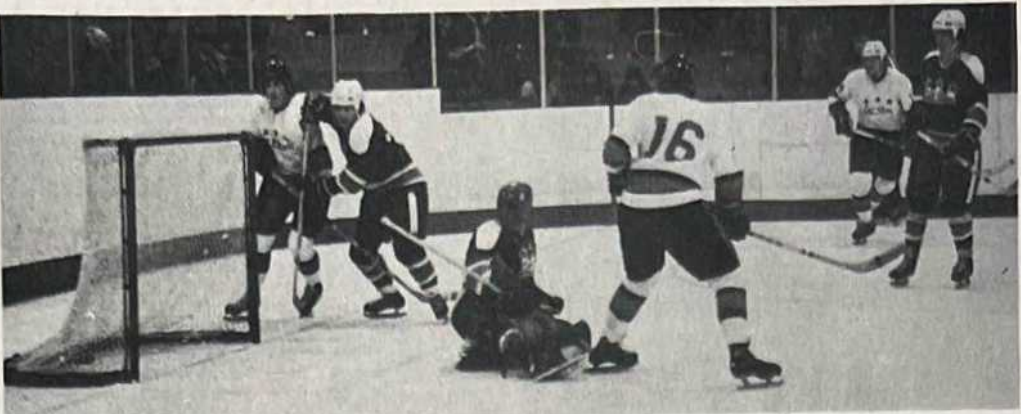
IT WAS A LONG, frustrating night for the Interior Division as they were thumped 8-3 by the Coast Division in the annual B.C. Junior Hockey League All-