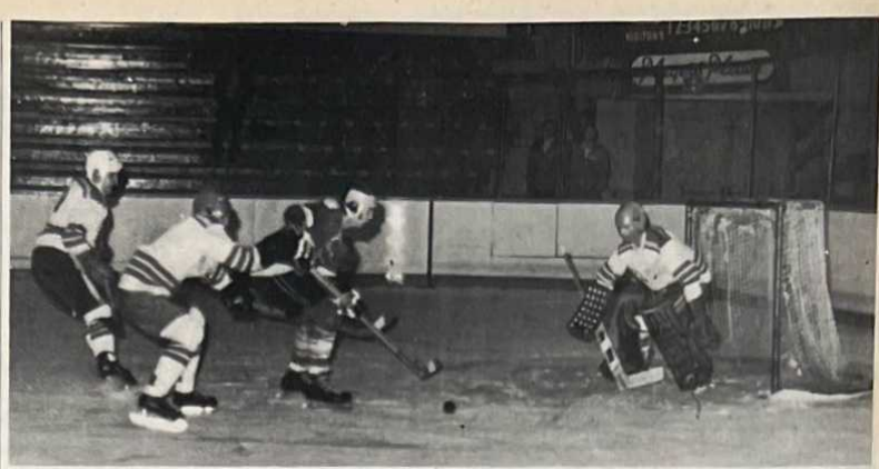
BIG WEEKEND FOR NHL FANS

Division IX 1. Aberdeen 3 2. East Fife 1 3. Falkirk 0 4. Rangers 2 5. Motherwell 1 6. Dundee U 3 7. Morton 0 8. Hearts 1 9. Johnstone 1 10. Clyde 1 11. Clydebank 1 12. Albion 0 13. Stranraer 3 14. Alloa 0