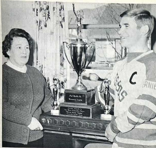
Pat Reilly memorial trophy winner