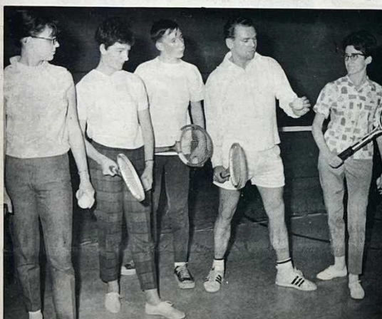
Tennis techniques taught