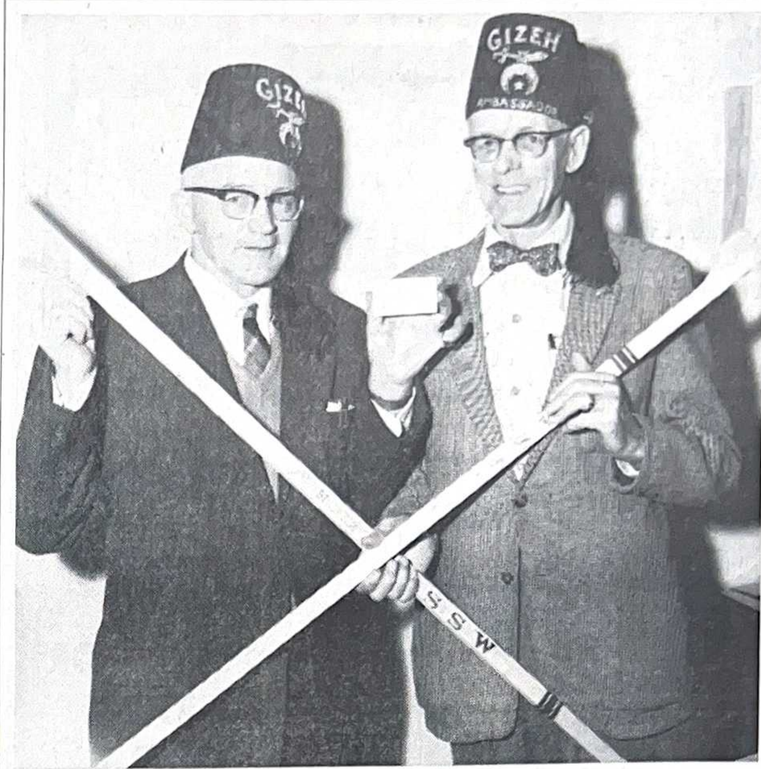
Tickets Selling Fast For Shriners Game